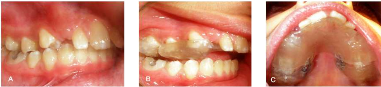
Fig 2: A, Occlusal and B, Lateral intraoral photographs of a 12-year-old boy treated with BMD after bonding BMD; C, Lateral photograph after

mm ( p < 0.01 ), respectively, which were statistically significant. The first premolars moved 2.26 \pm 1.12 ( p < 0.001 ) mesially and the upper incisors moved 3.551.46 mm ( p < 0.001 ) mesially which were also statistically significant. The mean amount of space opened between the first molar and the first premolar was 3.18 \pm 1.03 mm ( p < 0.001 ) which was also significant.